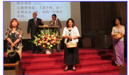
A tribute to fathers: flashlights presented by deaconesses.